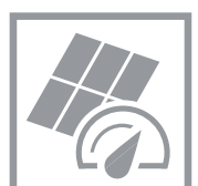
High module conversion efficiency