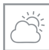
Excellent low light performance