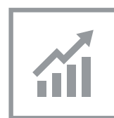
Plant optimization and yield increase